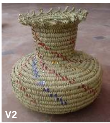
Large vase size: 18 cm