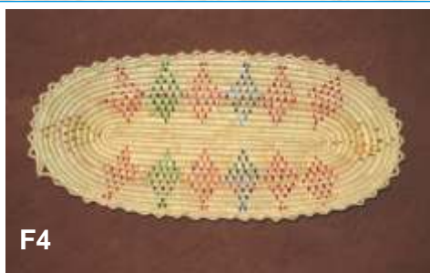
Oval Fruit tray size 45x22 cm