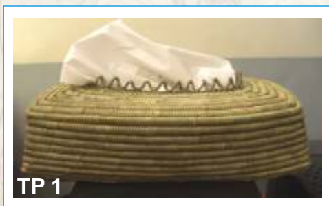
Tissue paper box with paper box