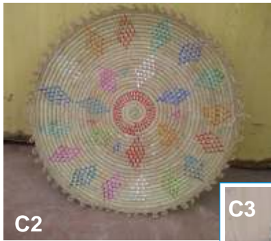
Changair with stand size 26 cm