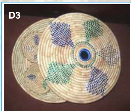
Dry Fruit Changair size: 28 cm (round)