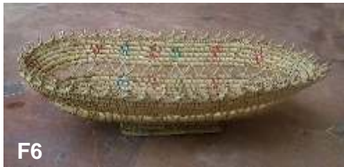
Fruit tray with net size 45x22 cm