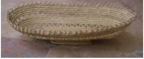
Fruit Tray with Net size 45x22 cm