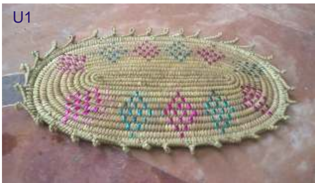
Oval dish mat, size: 18x28 cm