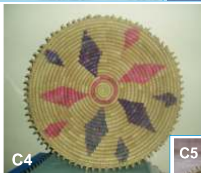
Changair with stand size 26 cm (round)