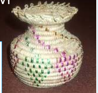
Small vase size 14 cm