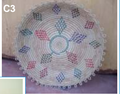
Changair with stand size 26 cm (round)