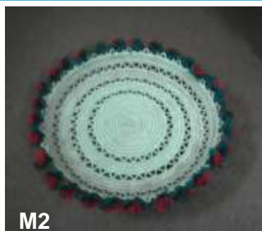
Fruit Changair Size's 40 cm round