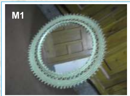
Size's 40 cm round