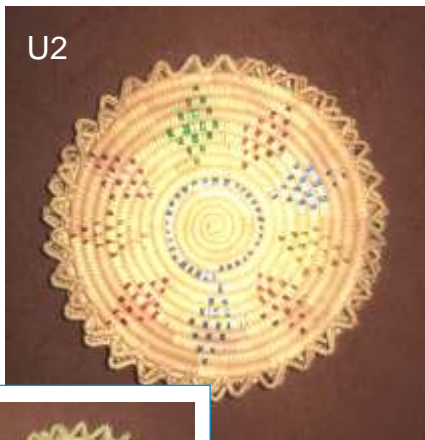
Round dish mat size :16 cm