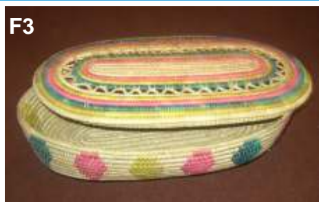
Oval fruit bowl with stand & lid size: 18x30 cm