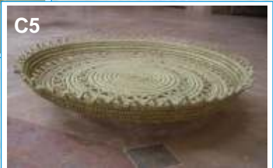
Changair with net 35 cm (round)