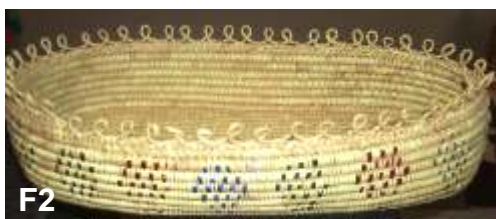
Oval fruit bowl size: 18x30 cm