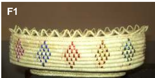
Oval fruit bowl size: 18x30 cm