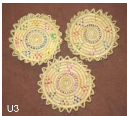
Glass mats(6 pcs) size :9 cm