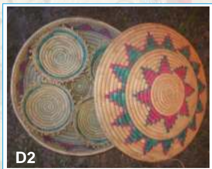
Tray size 28 cm (round)